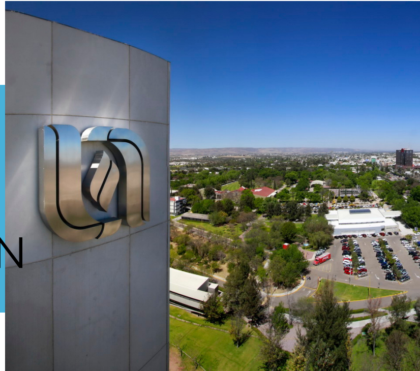
"UAA Entre Las 200 Universidades Más Reconocidas de Latinoamérica." UAA

Posters are only accepted in A0 upright format and in English. The poster sessions are during the Coffee and Lunch breaks from October 17th to 19th. Please hang your posters up on October 17th during the morning coffee break from 10:30 to 11:00.