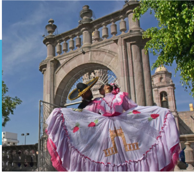
Ferias y Festividades